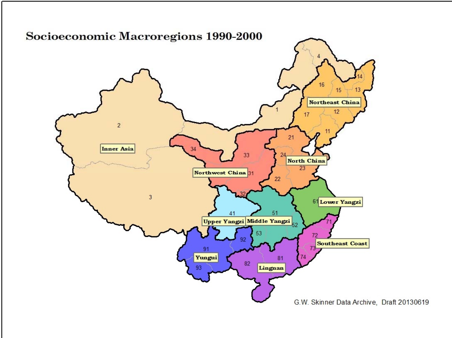
Map 1. Macroregions of China

southwest end of the Lower Yangzi Region (Map 1 21 and Map 2). 22 From a geographical point of view, this region is unusual in two regards.