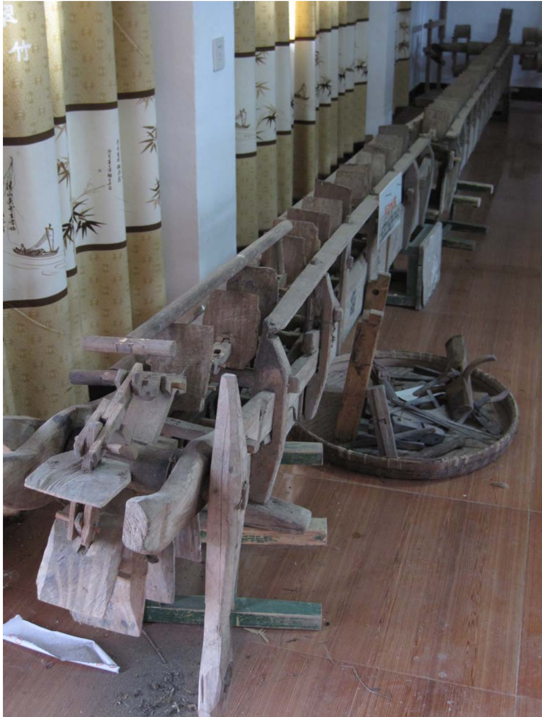
Figure 4 Foot-driven Dragon-Bone Water Lift, photographed in Zhaitan Museum on 26 September 2010

when rice was not sufficient, cakes and pies made from flour and filled with salted vegetables became popular and were required to help people survive the months before the rice harvest.