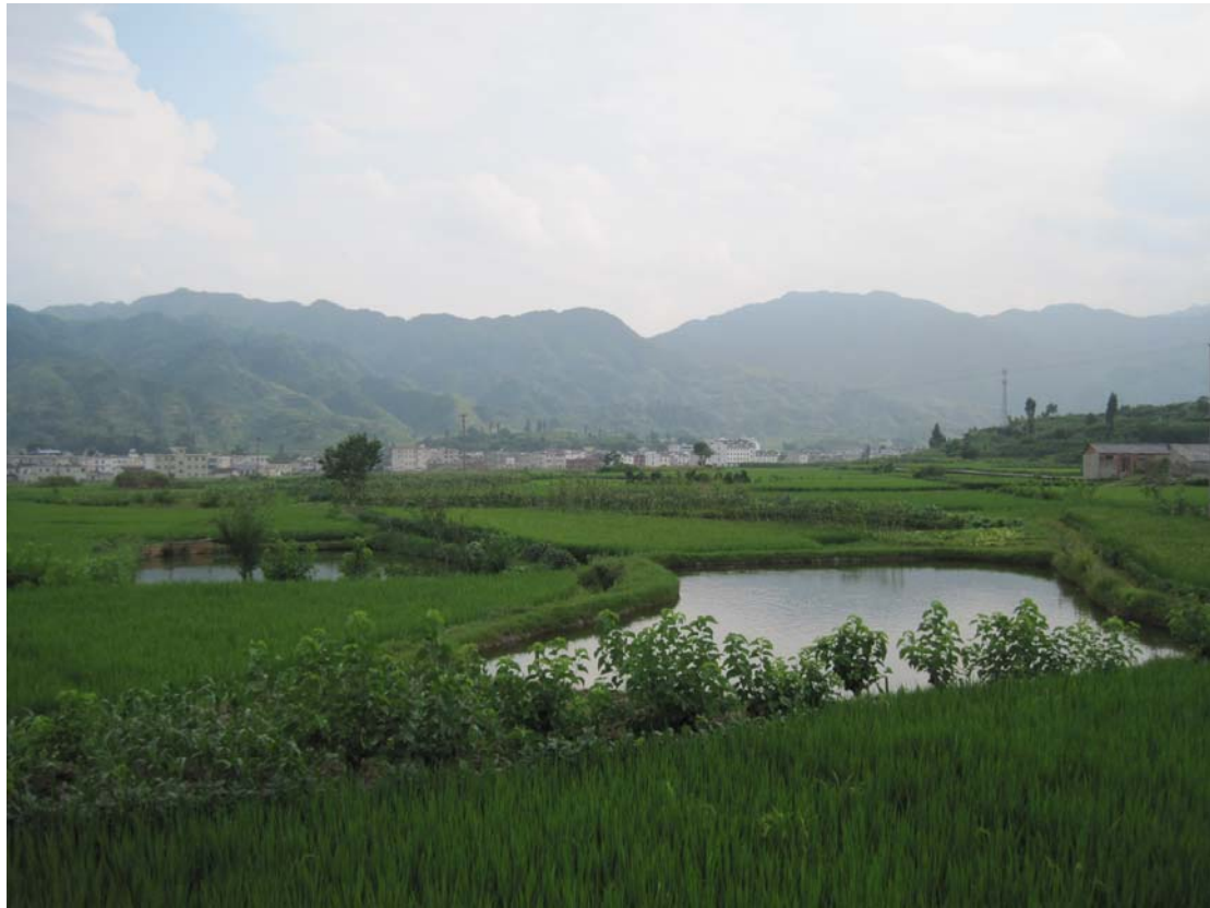
Figure 1. Fields in the north of Jixi County, photographed on 7 August 2011

side chambers have been demolished and are occupied by villagers' houses. Only two main yards have remained, and the remains of the stone sculptures and yards did suggest the scale of the original building.