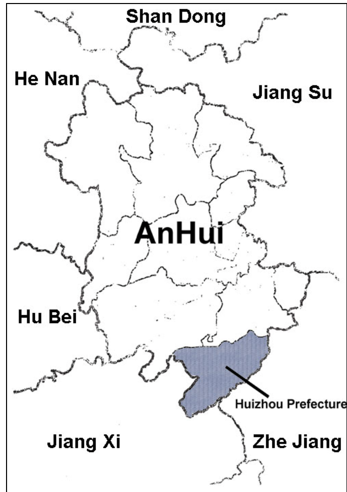
Map 2. Huizhou Prefecture in Qing Dynasty 23

First, in relation to the mountainous landscape, it bred a distinctive language, architecture, ethics, livelihood and social networks. As far as agriculture is concerned, the hilly landscape of Huizhou Region created two problems: a shortage of arable land, and difficulty in gaining access to stable irrigation. If we look down on the region from the air, it is easy to see that the region is divided by wide or narrow, long or short rivers. As most hills are too high to farm, only the scattered valleys and small patches of basins in the mountains can grow crops and also provide a residence for people. Thus local residents have spared no effort in making full use of every tiny piece of land. Almost every piece of land close to a water source, i.e. a stream, river or spring, has been transformed into rice paddy. Where there is difficulty getting access to water, vegetables and upland crops are planted. In this area, it is not surprising to find a single tiny paddy in a narrow valley near a stream, far from any